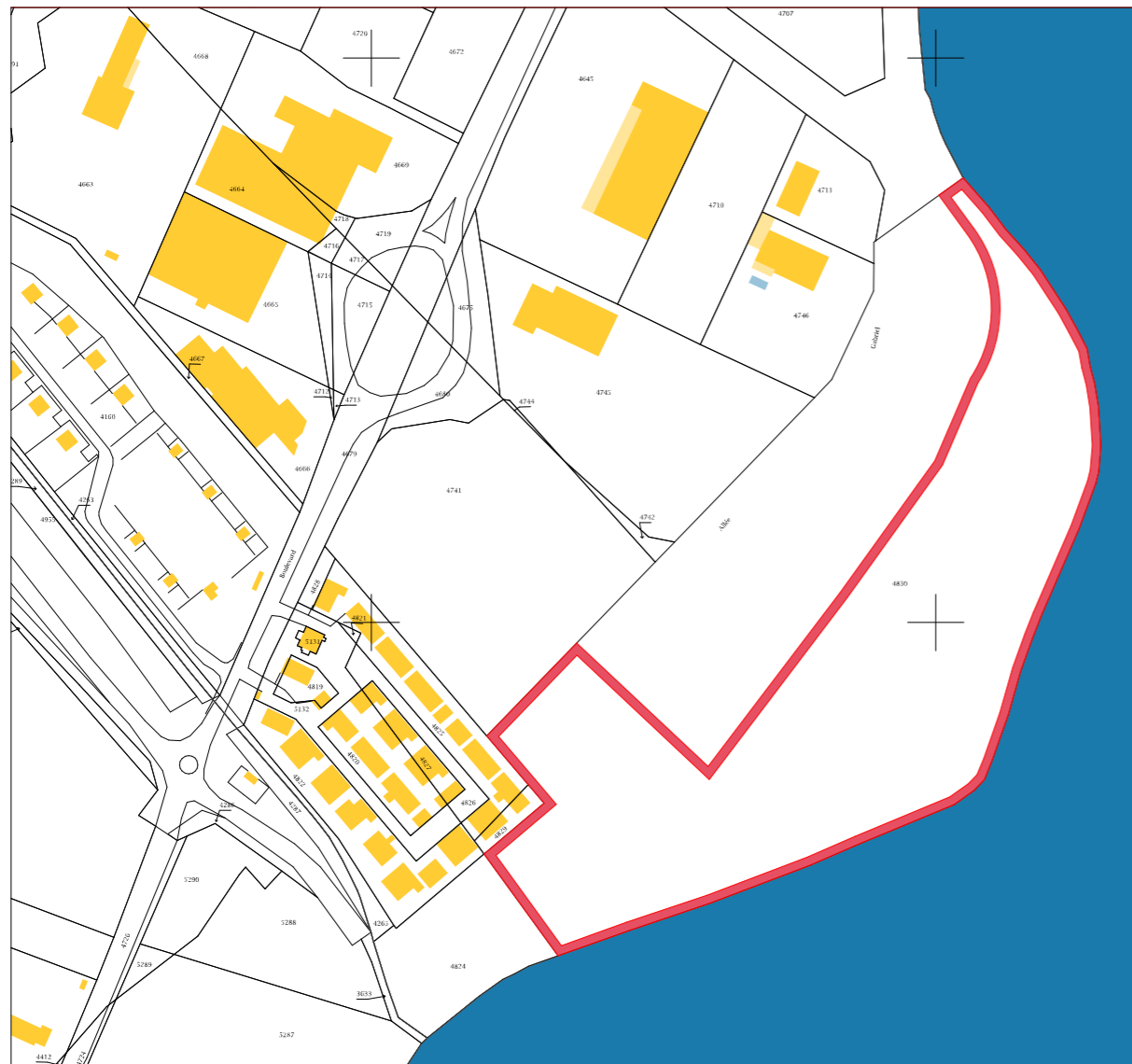
EXTRAIT CADASTRAL - 1/3000